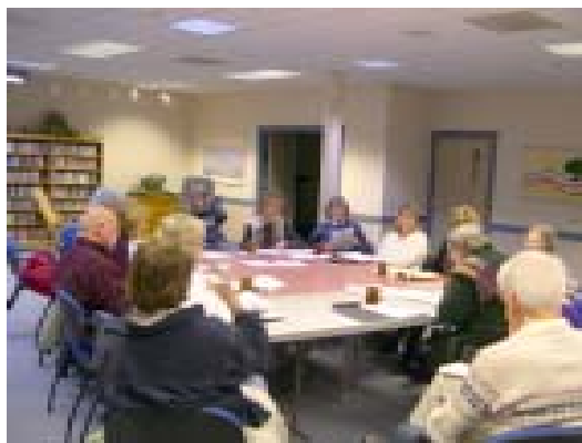
“lively” discussion brings new perspective to Redistricting Concurrence Meeting on February 27 at Linus Oaks